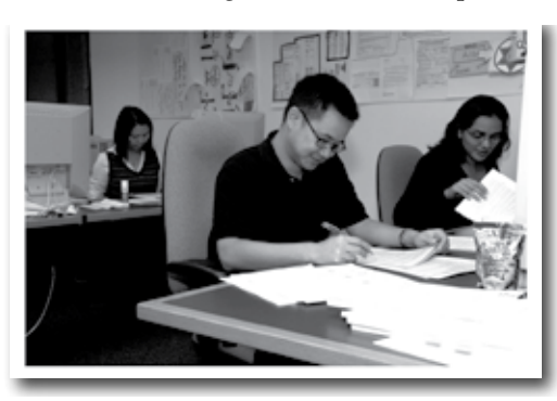
Prospective Claims Processing Employees

Our commitment to providing you with service at the highest level is exemplified