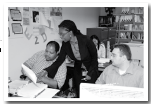
Prospective Claims Processing Employees

instructional materials and other training tools. Throughout the program, each trainee's progress is regularly monitored and evaluated.