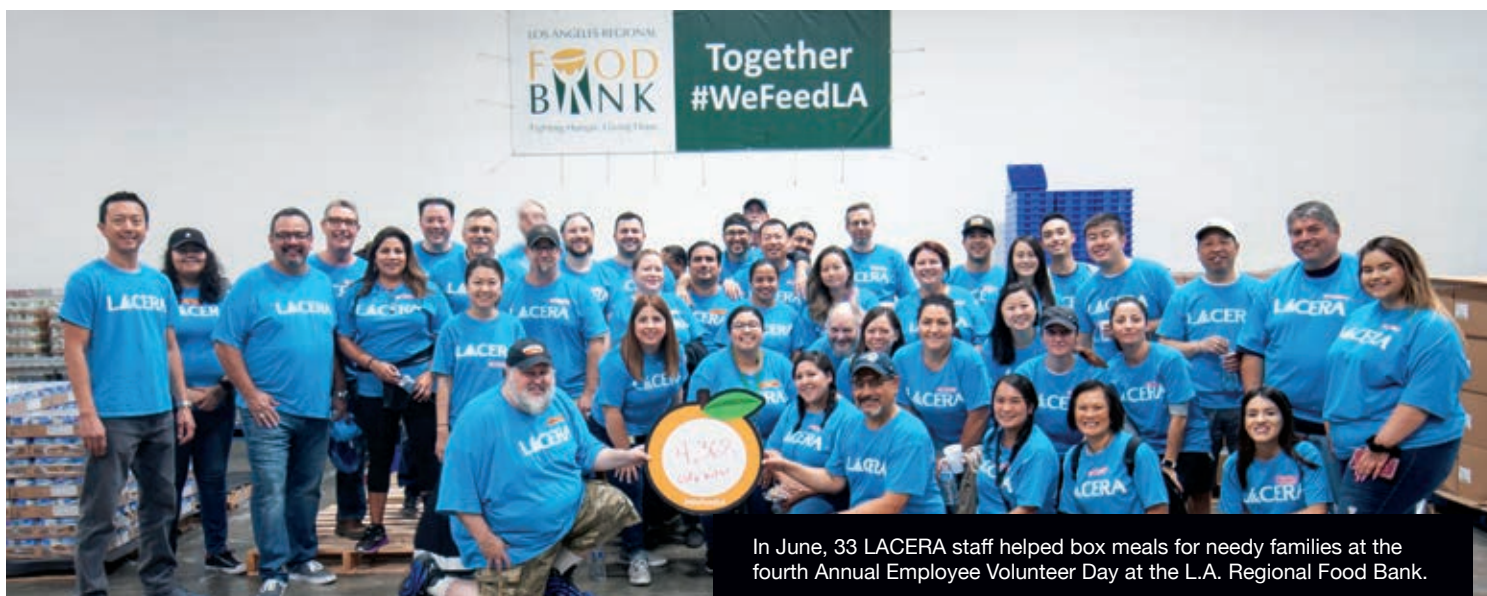
In June, 33 LACERA staff helped box meals for needy families at the fourth Annual Employee Volunteer Day at the L.A. Regional Food Bank.